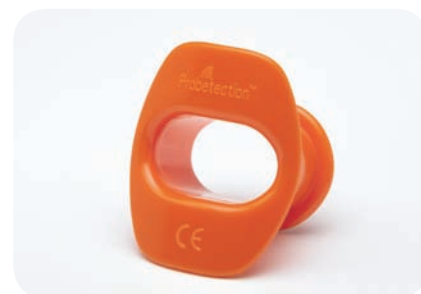
Probetection™ bite guard