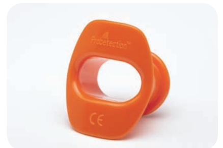
Probetection™ bite guard