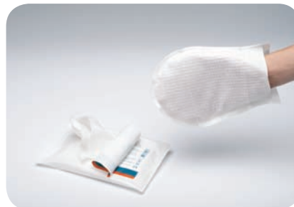
Purawash™ impregnated mitts