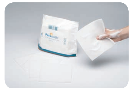
Puracloth™ wash cloths