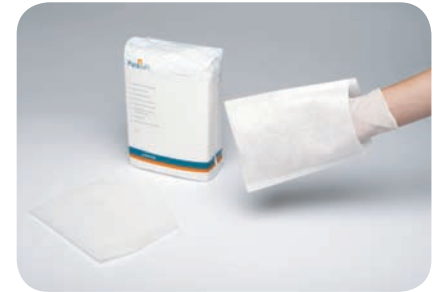
Purasoft™ dry mitts